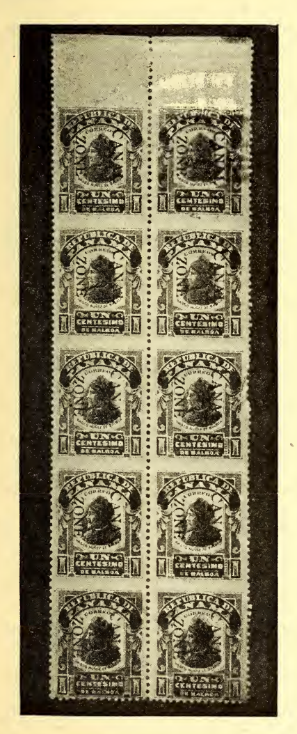
The 1c Imperforate Horizontally.

sue. On number 8 of the sheet of the first printing of the two centesimos de balboa the "N" of "ZONE" has broken serifs, and on a few sheets of the second printing of the same value the same error occurs on the 93rd stamp, which in the reversed position of the surcharge is complementary to the 8th stamp of the first printing. The error was soon discovered and corrected.